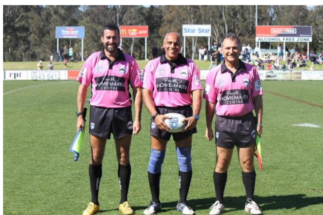
Under 19 Division 2