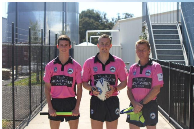
Under 17 Division 2