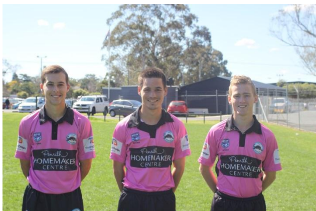
Under 19 Division 1