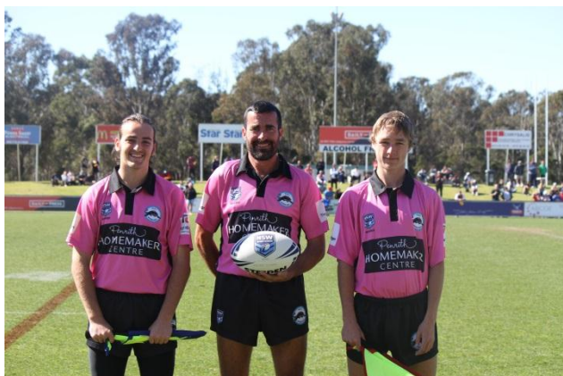
Under 16 Division 2