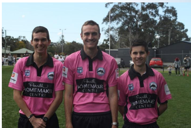
A Reserve Division 1