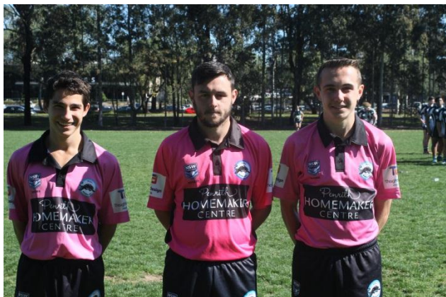
Under 16 Division 1