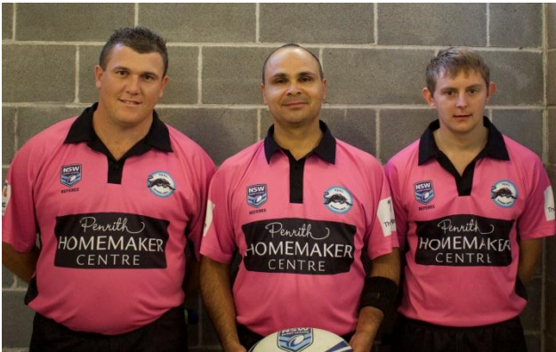
A Grade Division 3