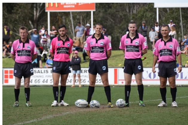
A Grade Division 2