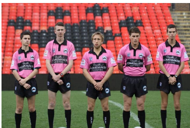
A Grade Division 1