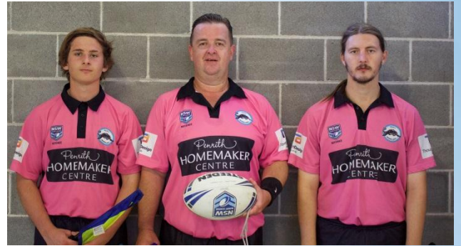
Under 17 Division 3