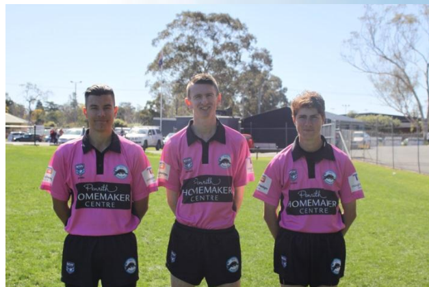
Under 17 Division 1