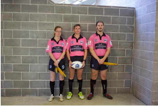
Under 16 Division 3