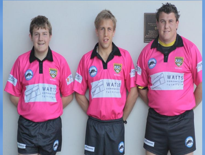
Under 17 Division 1, Tier A