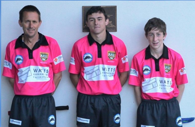
Under 16 Division 3