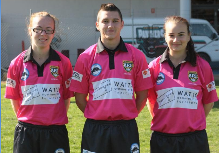
Under 16 Division 1, Tier A