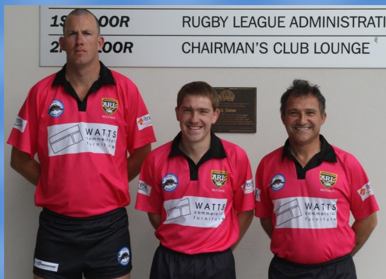
A Grade Division 1, Tier B