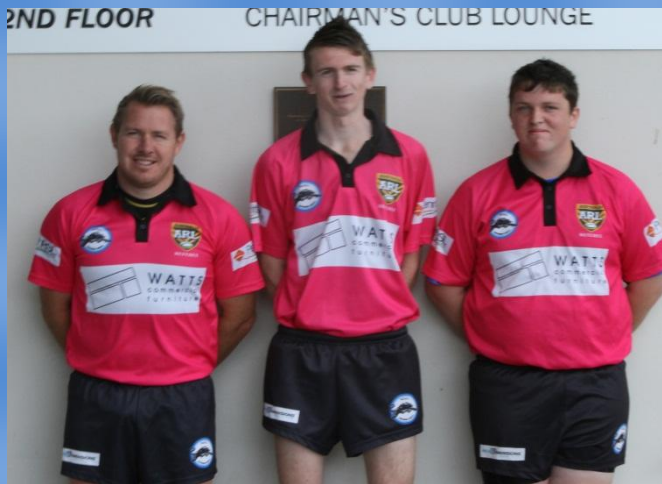
Under 19 Division 1, Tier B