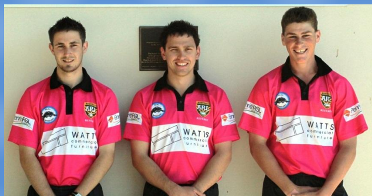
A Grade Division 2