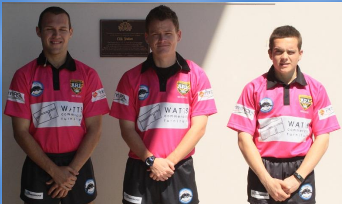
Under 19 Division 1, Tier A