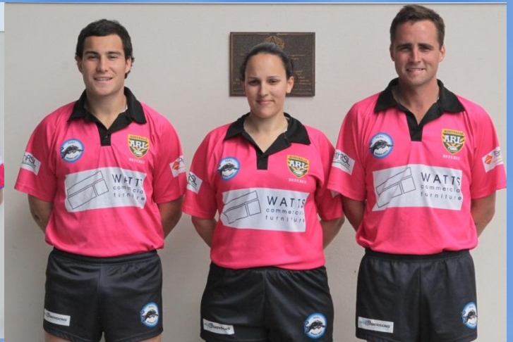
A Reserve Division 1, Tier B