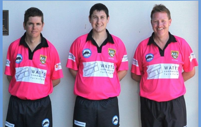
Under 16 Division 2