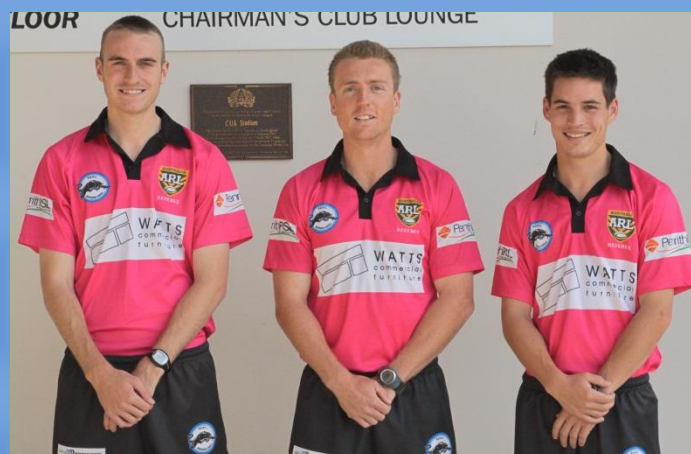
A Grade Division 1, Tier A