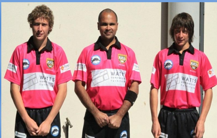
Under 17 Division 2