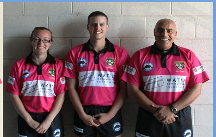
Under 19 Division 2