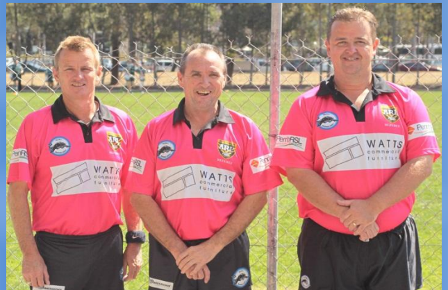
A Reserve Division 1, Tier A