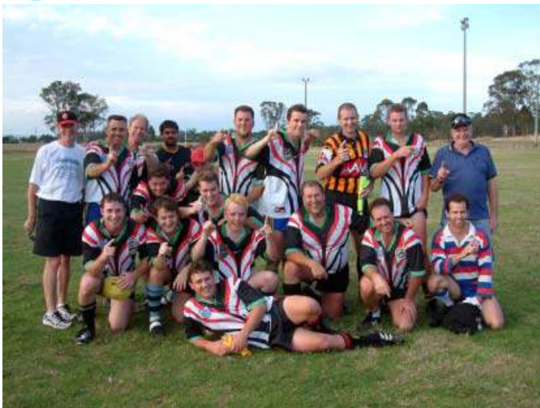
The Senior Team plus hangers on