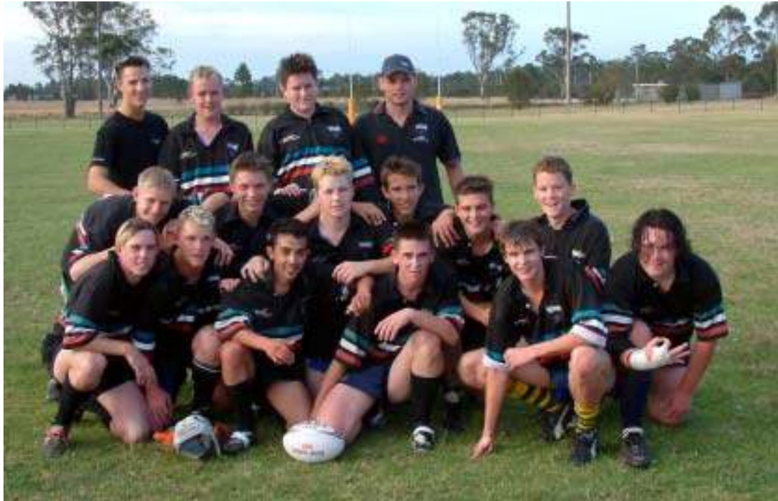
The Gallant Junior Team