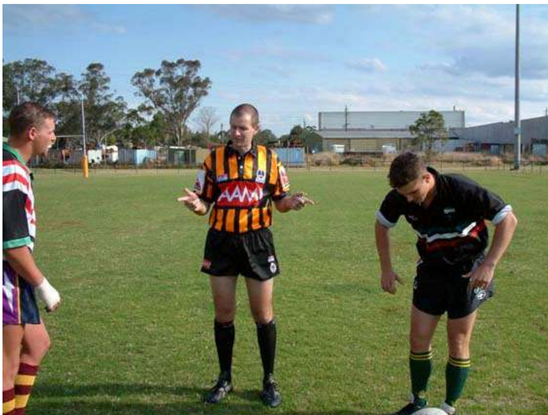
Now for a change, I want a good CLEAN Game!!!